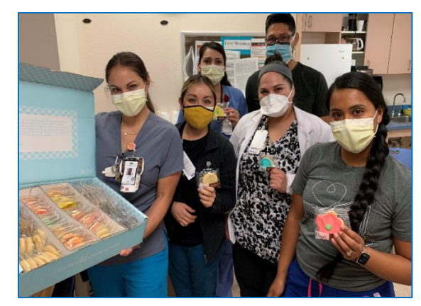
UMC's ICU Staff Poses with the Cookie Donation

Thank you ICU staff for your constant care for our patients! UMC continues to receive many donations from people and organizations who are grateful for the service and compassion our Team UMC provides.