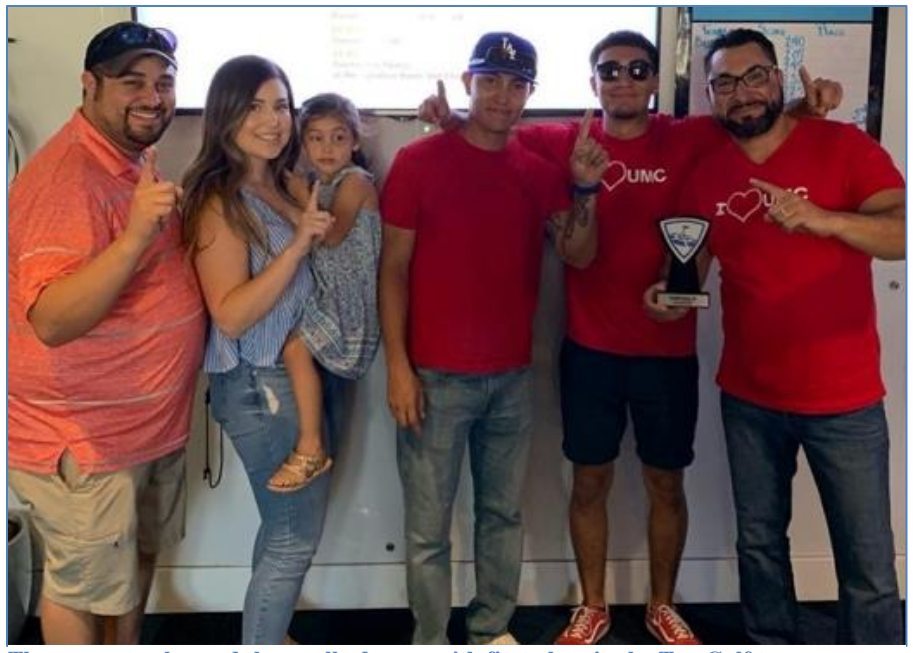
They came to play and they walked away with first place in the Top Golf tournament.

As for Top Golf, plans are already in the works for Top Golf 2020!