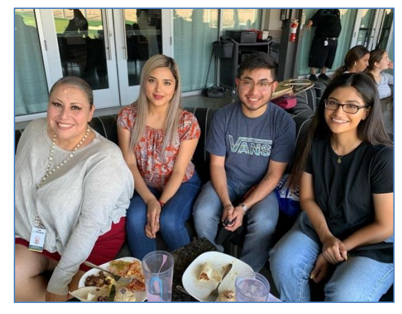
Family and friends enjoy a delicious breakfast.