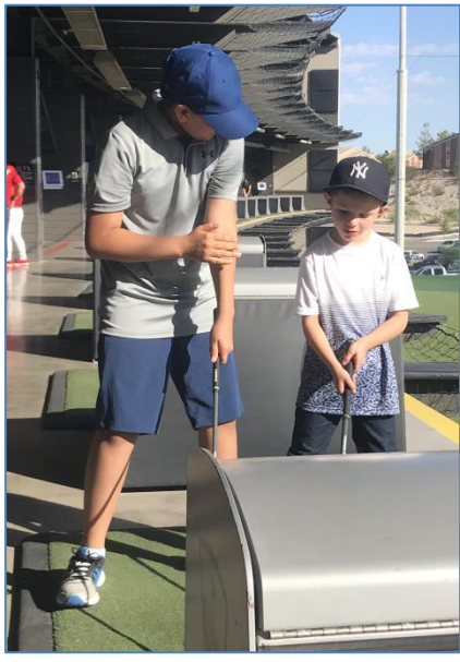
There's nothing quite like getting your first golf swing lesson from your older brother.