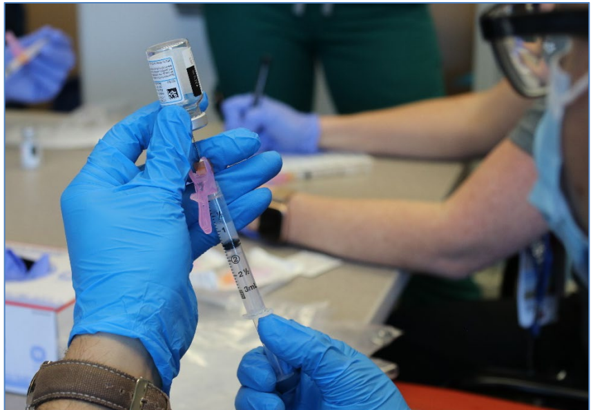
A UMC Pharmacist fills a syringe of the Moderna COVID-19 Vaccine

As the rollout of the COVID-19 vaccine was administered across the United States, it allowed Americans to look positively toward the end of a pandemic that has flipped upside-down the structure of everyday lives. As of Jan. 14, Texas became the leader of vaccinations in the United States by reaching one million administered vaccines before any other state. However, in order to reach this milestone, there must be hardworking healthcare personnel needed to step up to this task.